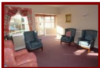
Upstairs Sun Lounge